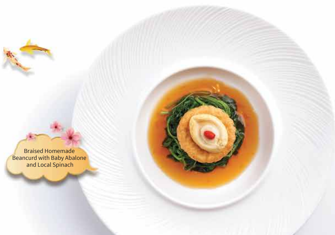
Braised Homemade Beancurd with Baby Abalone and Local Spinach

Braised Vegetables with Yam, Vermicelli and Preserved Bean Paste