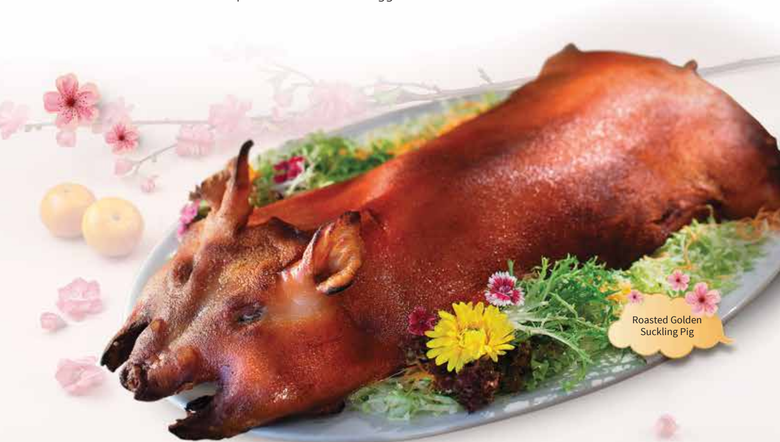
Roasted Golden Suckling Pig

Pan-fried Foie Gras Accompanied with Stir-fried Egg White