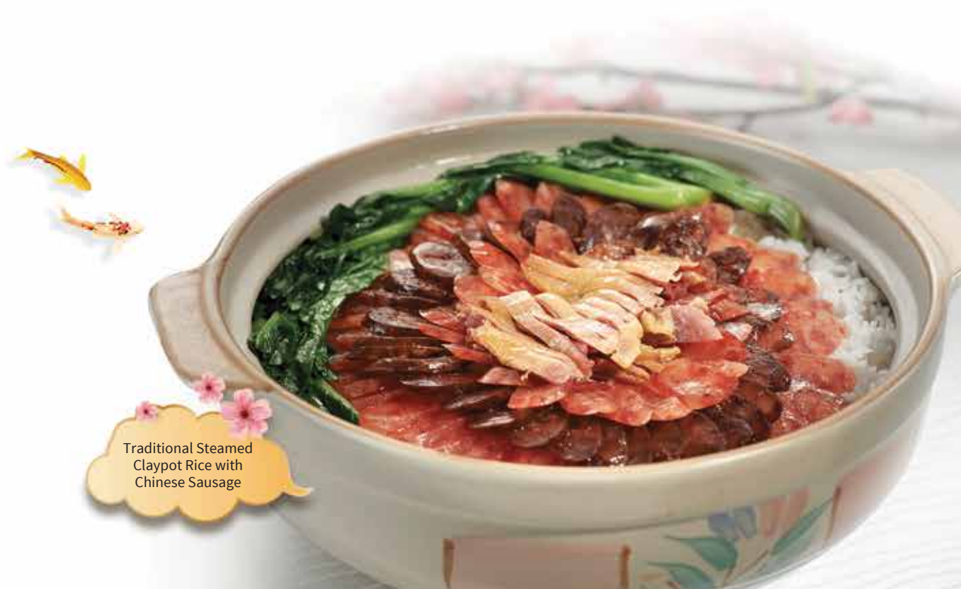
Traditional Steamed Claypot Rice with Chinese Sausage

Fried Rice with Roasted Pork and Petite Abalone