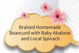
Braised Homemade Beancurd with Baby Abalone and Local Spinach