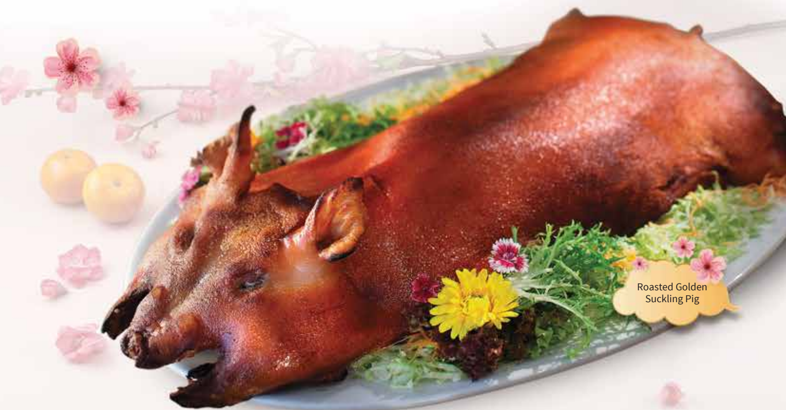
Roasted Golden Suckling Pig

Pan-fried Foie Gras Accompanied with Stir-fried Egg White