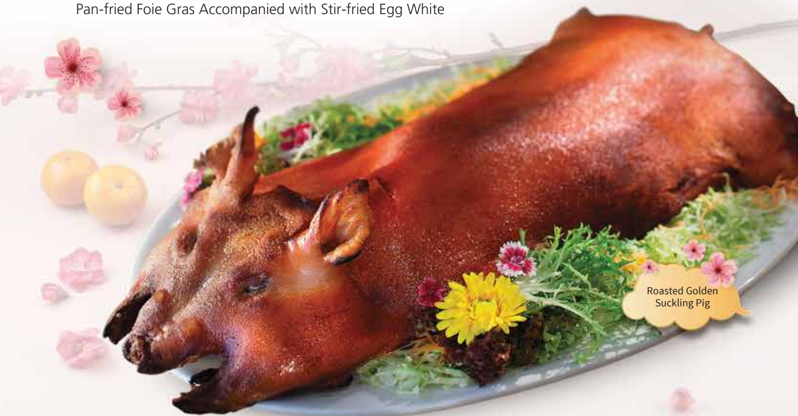
Roasted Golden Suckling Pig

Pan-fried Foie Gras Accompanied with Stir-fried Egg White