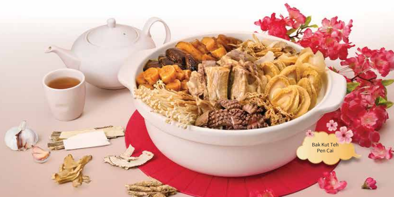
Bak Kut Teh Pen Cai

Braised Baby Abalone with Sea Cucumber and Goose Web