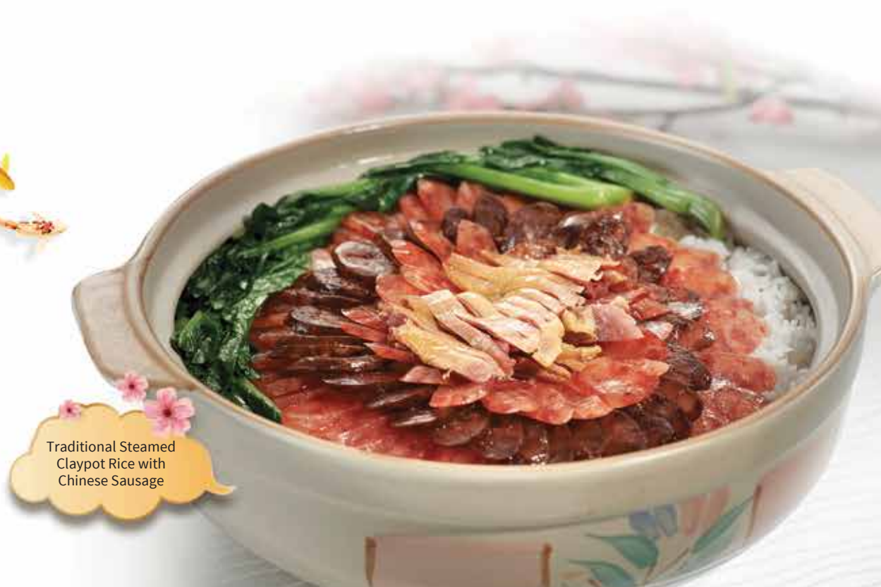
Traditional Steamed Claypot Rice with Chinese Sausage

Fried Rice with Roasted Pork and Petite Abalone