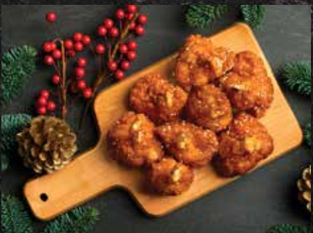
马麦酱鸡翅锤 ..... $20.80+ Marmite-Glazed Chicken Wing Sticks (8pcs)