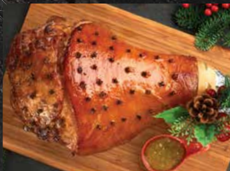
梅酱烤火腿 (带骨) ..... $138.00+ Plum-Glazed Ham (Bone-in) (approx. 3kg)