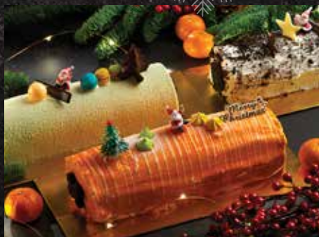
圣诞树筒蛋糕 Christmas Logcake (1kg) • Ondeh Ondeh ..... $68.80+ • Orange Galaxy ..... $52.80+ • Black Velvet ..... $48.80+