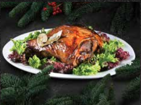
烤羊肩配薄荷酱与姜丝醋 ..... $148.00+ Baked Shoulder of Lamb served with Duo Sauce (Mint and Vinegar with Ginger slices) and a Medley of Vegetables (approx. 2 to 2.5kg)