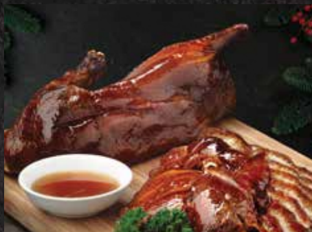
伦敦烤鸭 ..... $88.00+ Whole London Roast Duck