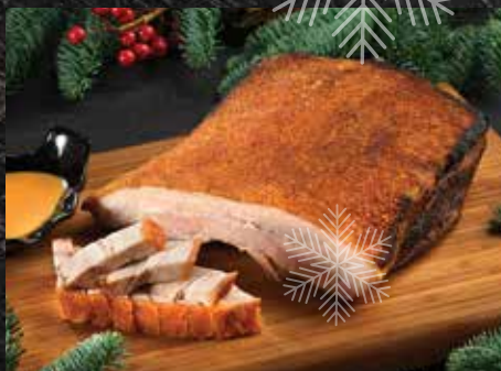
脆皮烧肉配芥末酱 ..... $58.00+ Roasted Crispy Pork served with mustard sauce (approx. 1kg)